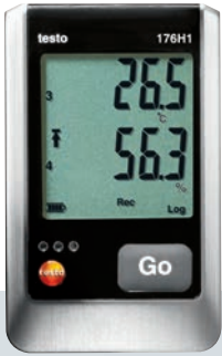
testo 176 Logger family with various channels for temperature and humidity