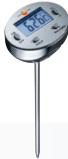
Universal waterproof mini-thermometer