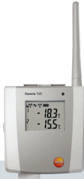
testo Saveris Monitoring system for the uninterrupted monitoring of ambient parameters