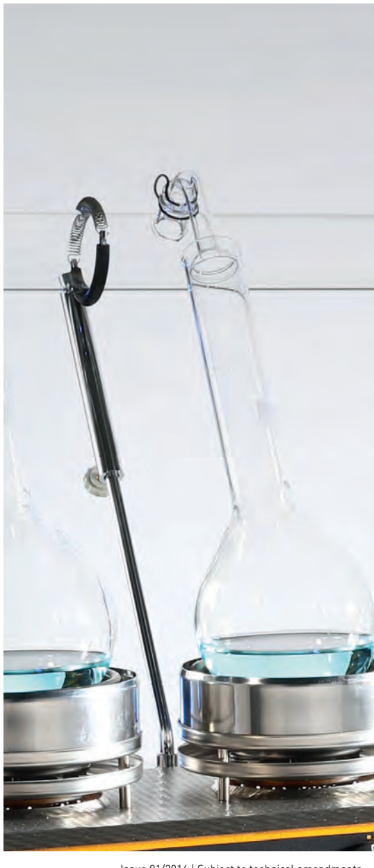
Issue 01/2016 | Subject to technical amendments