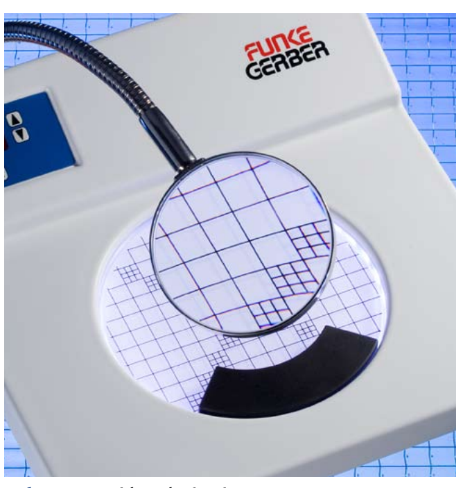
ColonyStar with reducing insert

Easy-to-clean plastic casing, height adjustable, illumination area of 145 mm Ø with 1 cm<sup>2</sup> and 1/9 cm<sup>2</sup> graduation. Petri dishes of up to 145 mm Ø can be used. The supplied reducing insert can be used for dishes with smaller diameters.