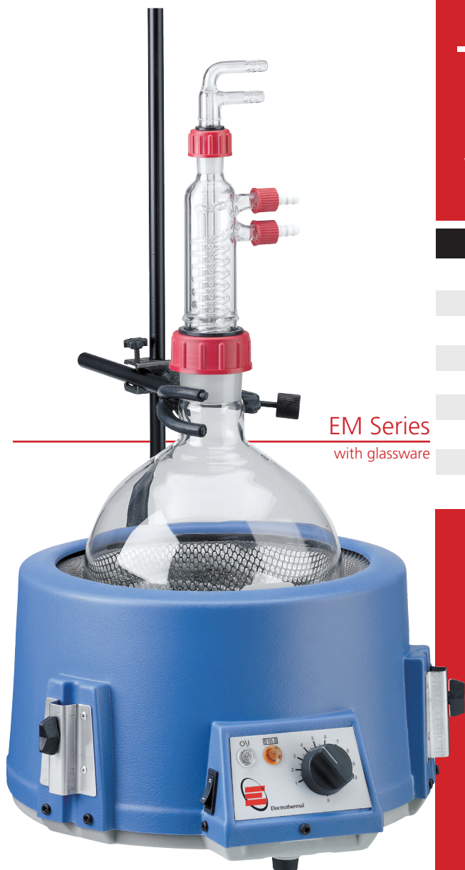
EM Series with glassware