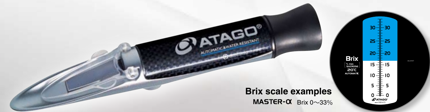
Brix scale examples MASTER-α Brix 0~33%

Choose the right model for your sample, based on the features and materials of the instrument.