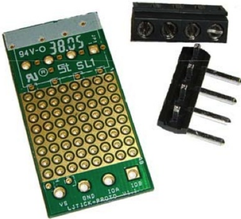
Figure 1: LJTick-Proto (LJTP)

Besides the exceptions that follow, the LJTP consists of various unconnected holes. The user must provide the desired connections.