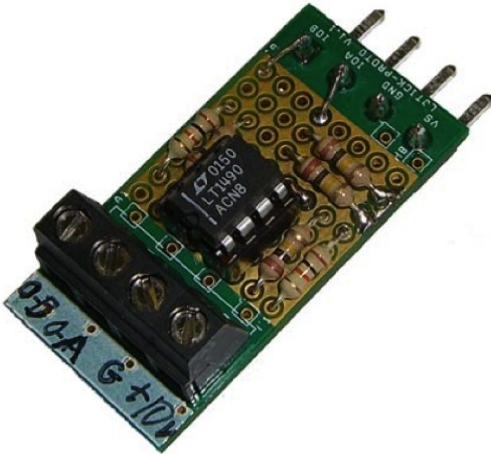
Figure 2: 2X output amplifier built on LJTick-Proto (Top)

Samtec FWS-04-02-T-S-RA. Any connector designed for 5 mm or 0.2" hole-spacing should be fine.