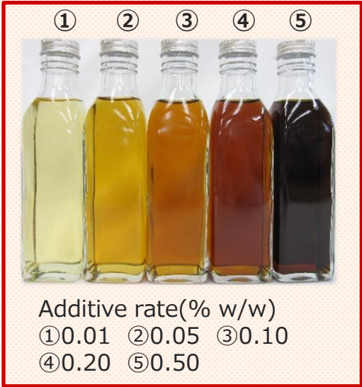
Color of caramel solution