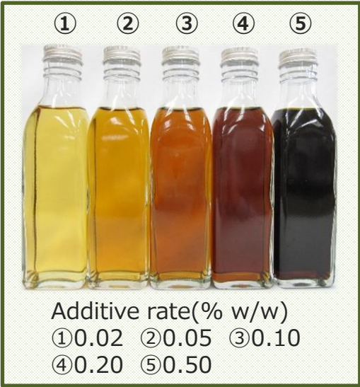
Color of caramel solution