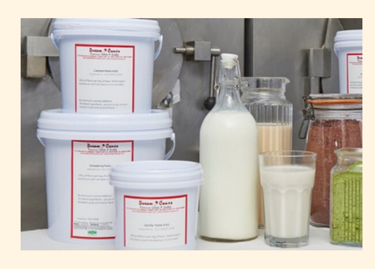
Packing size 4 kg