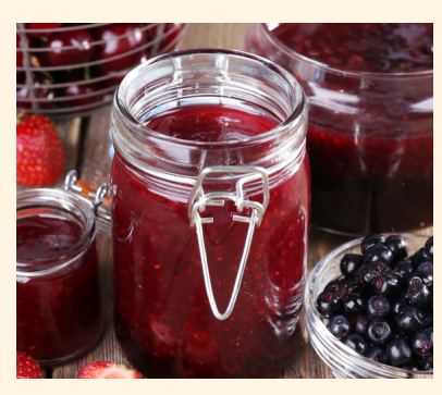
Blueberry Jam: Pure Berry Bliss Indulge in the rich, juicy flavor of blueberries with this sweet and versatile jam, perfect for any dessert.

Savor the timeless taste of strawberries with our rich and fruity strawberry jam. Bursting with fresh strawberry flavor, this classic topping adds a sweet, vibrant touch to any dessert. Perfect for layering, swirling, or drizzling—an all-time favorite that never goes out of style!