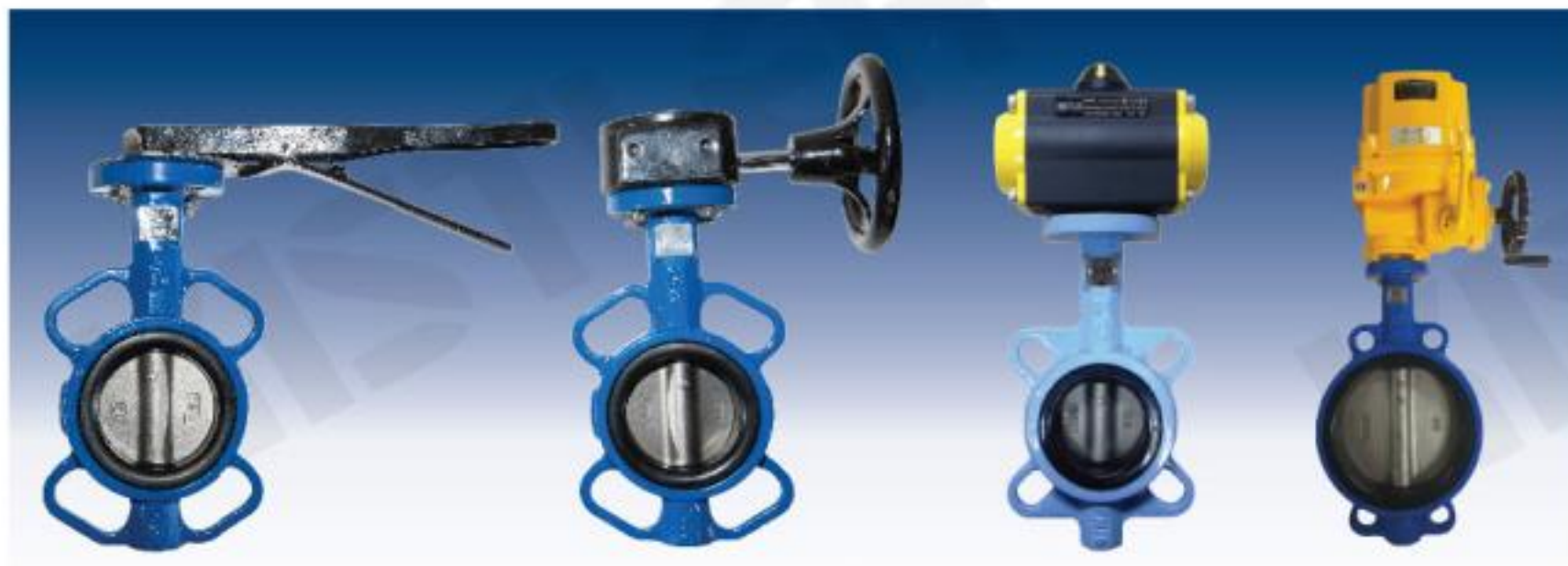
Fig. BFV100L - WAFER Cast Iron Body Lever Operated BFV100G - WAFER Cast Iron Body Gear Operated

Butterfly valves of KISTLER's design is apparent which utilize the phenolic-backed cartridge seat. These valves feature precision machined parts insuring years of dependable operation. With many body/trim combinations. The design can be suitable for BS/DIN/ANSI/JIS/UNI standard, etc. There are coating epoxy paint of 200um.