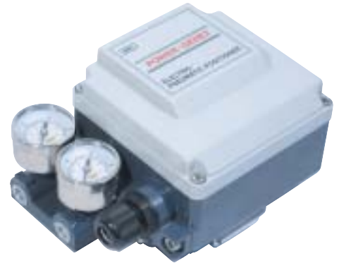
EPL (Linear Type)