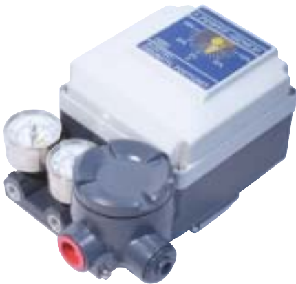
EPR (Rotary Type)