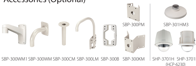
SBP-300WM1 SBP-300WM SBP-300CM SBP-300LM SBP-300B SBP-300KM SHP-3701H SHP-3701F (HCP-6230)