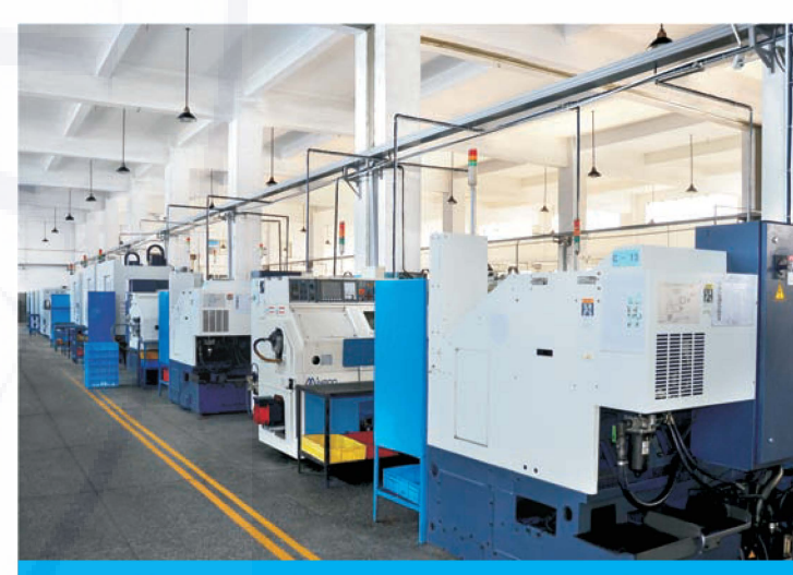
Precision CNC Lathe, we imported BROTHER from Japan