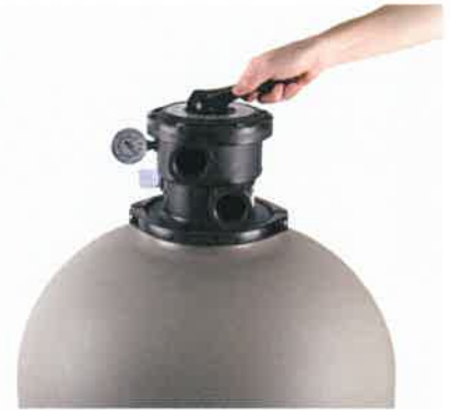
7-position VariFlo® control valve with easy-to-use lever-action handle lets you dial any of 7 valve/filter functions.