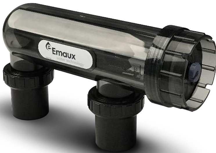
Titanium cell with 2 meters cable

Salt chlorinated pools are among the best to enjoy and offer comfortable bathing, but such systems tend to raise pH. The Emaux SSC-one takes the guesswork out of adding the chemicals: its dosing pump injects acid to automatically maintain the correct pH level, and its cell takes care of the chlorine production. Programmed automatically and using the best quality of salt, no harmful by-products are produced. One of the most technically advanced and user friendly salt water chlorinators on the market.