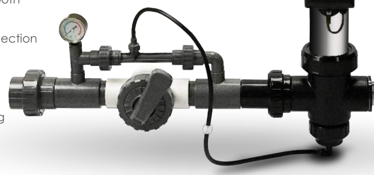
Note: 'O" stands for Ozone, "T" stands for Timer