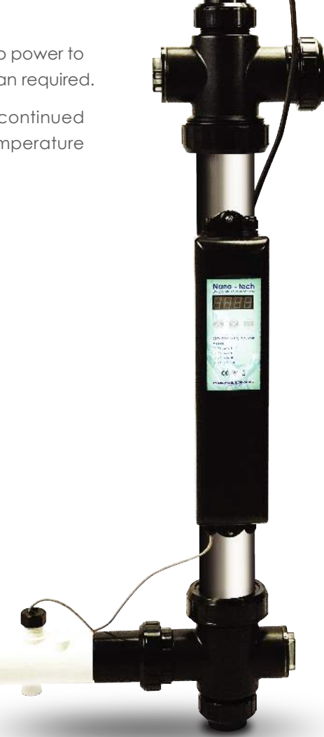
Note : 'F" stands for Flowswitch, "T" stands for Timer