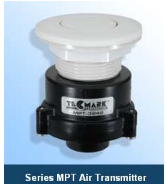
Series MPT Air Transmitter

Tecmark's manufacturing philosophy is unique. In an effort to provide you with a product that is most suited to your application, Tecmark® transmitters incorporate interchangeable components for the ultimate in design flexibility. This means a product tailored to your needs without the high price and long lead times associated with custom manufacturing. If you have a need and don't see the features you require, please ask us!