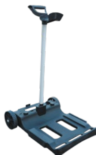
Caddy cart included

Top access to filter panel for simple maintenance. The filter panel is easy to remove, easy to clean and easy to replace.