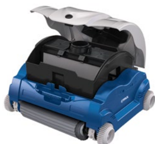
Inside the cleaner