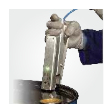
Bond-Rite CLAMP: Pulsing LED confirms equipment is grounded.