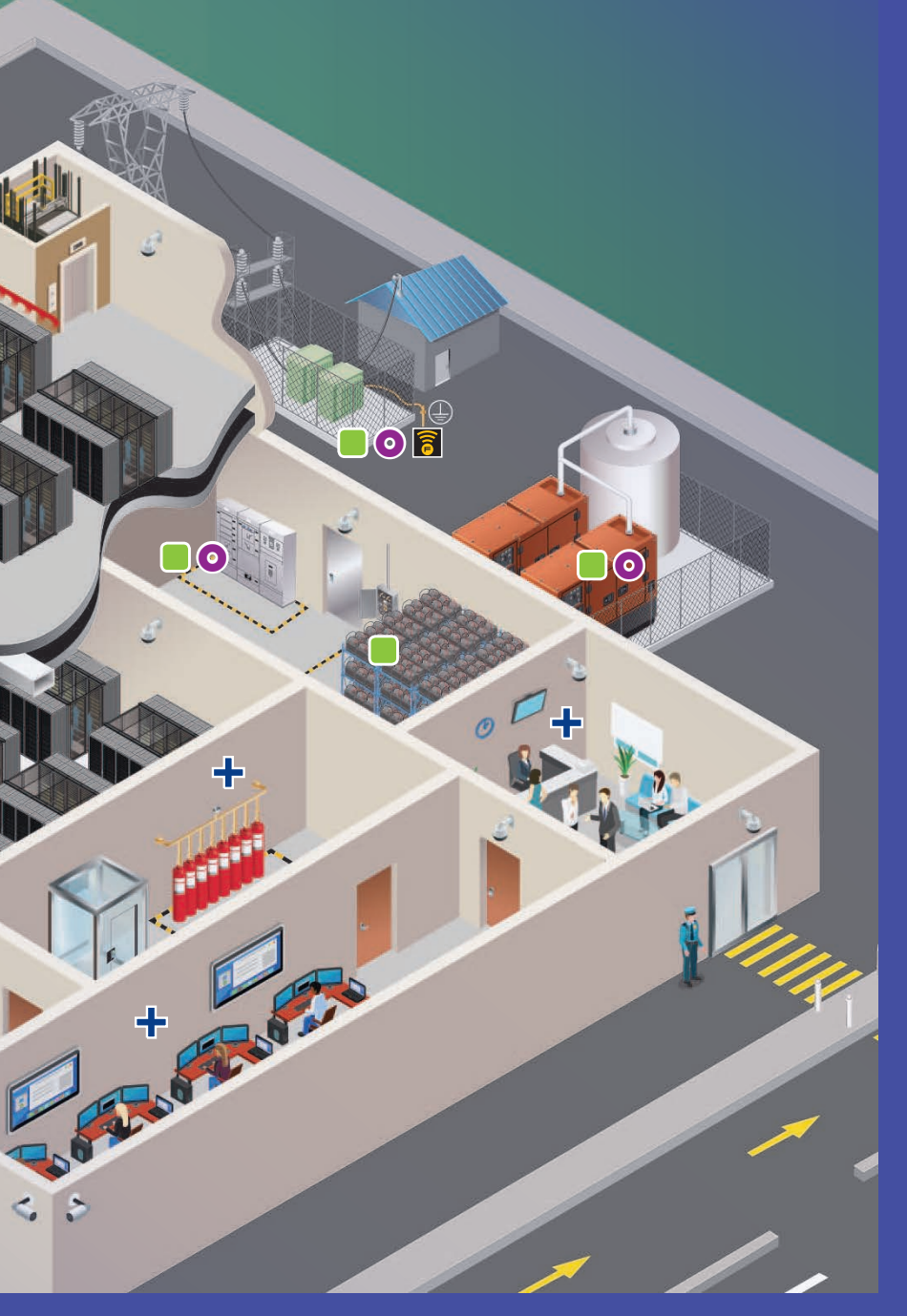
Diagram is not intended to be an exact representation. Diagram components are not to scale and are for illustration purposes only.