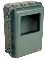
EJB 241 M1