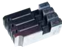
112R Dies 8A-10A 150003