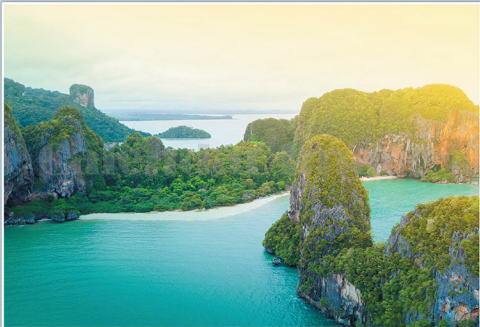
Aerial view of Phranang Beach, Railay Bay in Krabi with the spectacular mountain and white beach along the emerald water and island in morning.