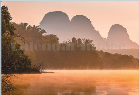
Beautiful fog reflection on water at sunrise time, Ban Nong Thale, Krabi.