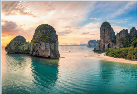
Aerial view of the beautiful Phra Nang Cave beach at the Krabi.