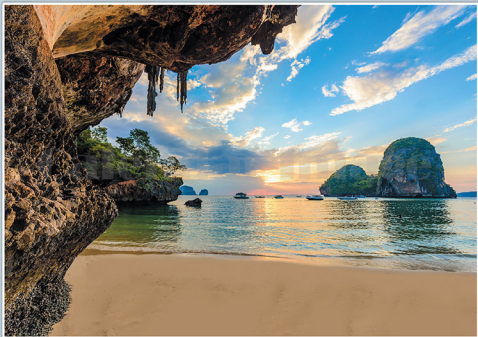
Phra Nang Cave Beach at sunset - Tropical coast scenery of Krabi.