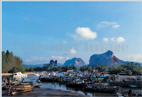
A Picture perfect of pier at Nopparat Thara beach.