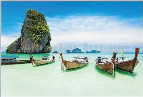
Longtail boat at the beach Krabi.