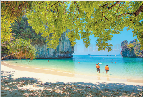
Tropical beach scenery, Andaman sea, View of koh hong Island krabi.