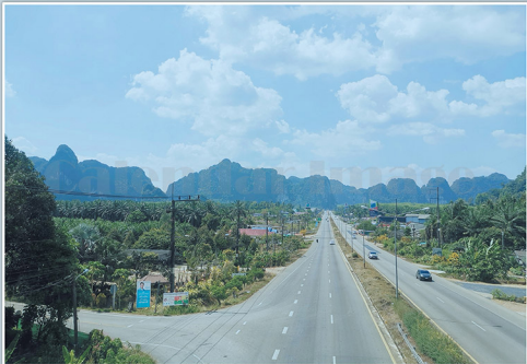
Beautiful scene of roads with mountains surrounded Krabi.