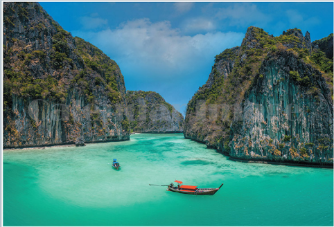
Landscape of Pileh lagoon in Phi Phi Leh Island, Famous place snorkel, Andaman sea, Krabi.