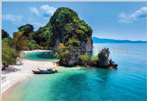
Aerial view of Koh Hong island in Krabi.