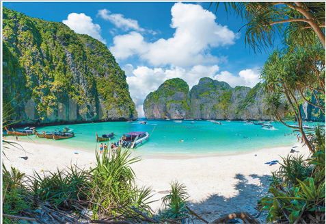
Amazing Maya Bay on Phi Phi Islands, Krabi.