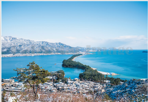
Amanohashidate Bridge to heaven viewpoint in winter Kyoto.