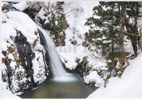
Shirogane Falls in winter near Obanazawa, Yamagata Prefecture hot springs town in winter season.