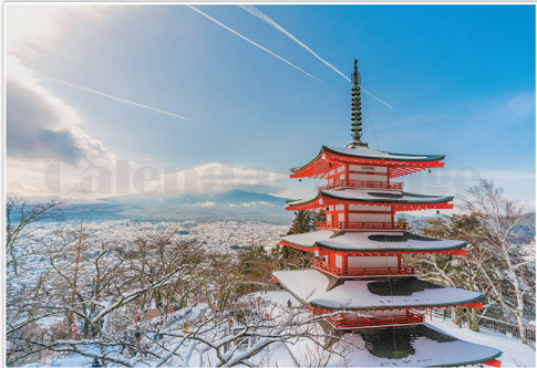
The Chureito Pagoda with the background of Mt. Fuji during winter with cloud hat is cover, Yamanashi.