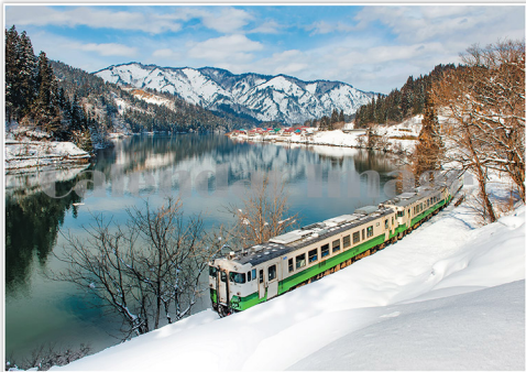
Tadami Line Train run along Tadami Riverside in Winter at Aizu-Kawaguchi, Mishima, Fukushima.