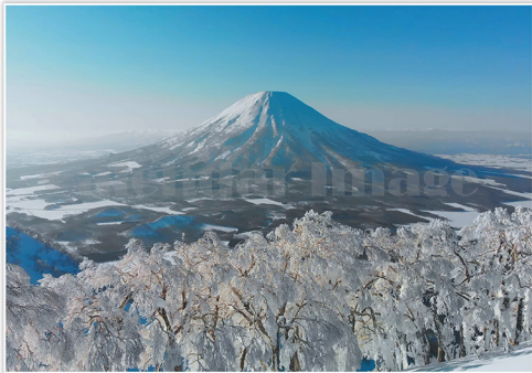
Aerial view of Mt. Fuji Mountain in Japan at winter season.