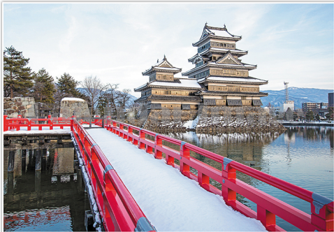
Matsumoto castle against blue sky in Nagano city, Japan. Castle in Winter with heavy snowfall.