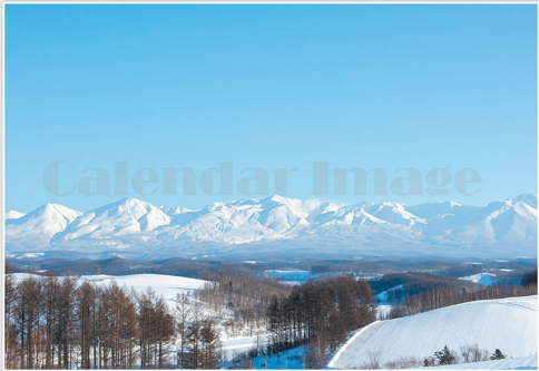
Hills and mountains in winter.