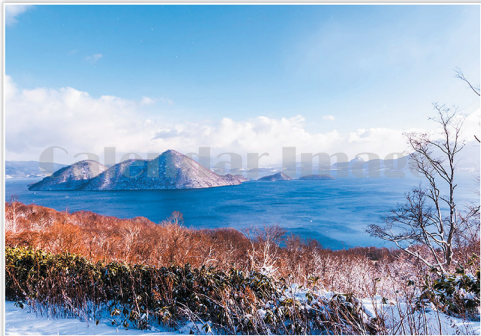
Lake Toya in Hokkaido winter.