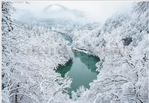
Bridge on a river with snow mountain as background in Tadami, Fukushima.