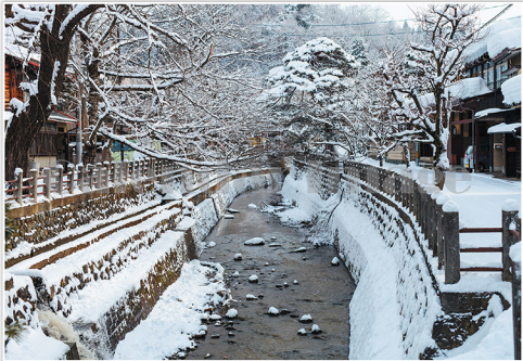
Takayama town on winter day.