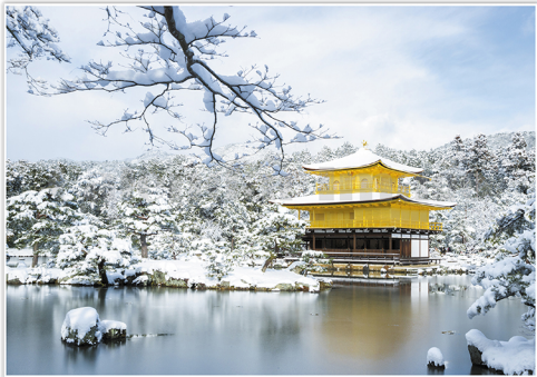
The Golden Pavilion (Kinkakuji) with snow in Winter Season Kyoto.