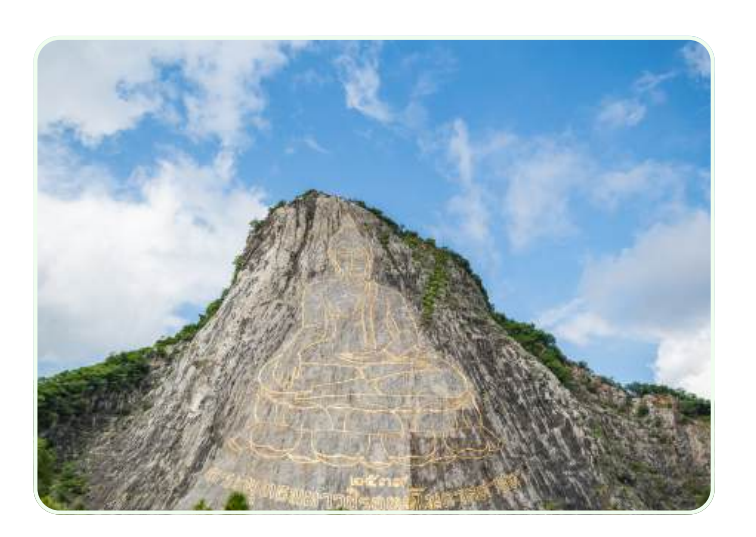
Chee Chan Buddha Image