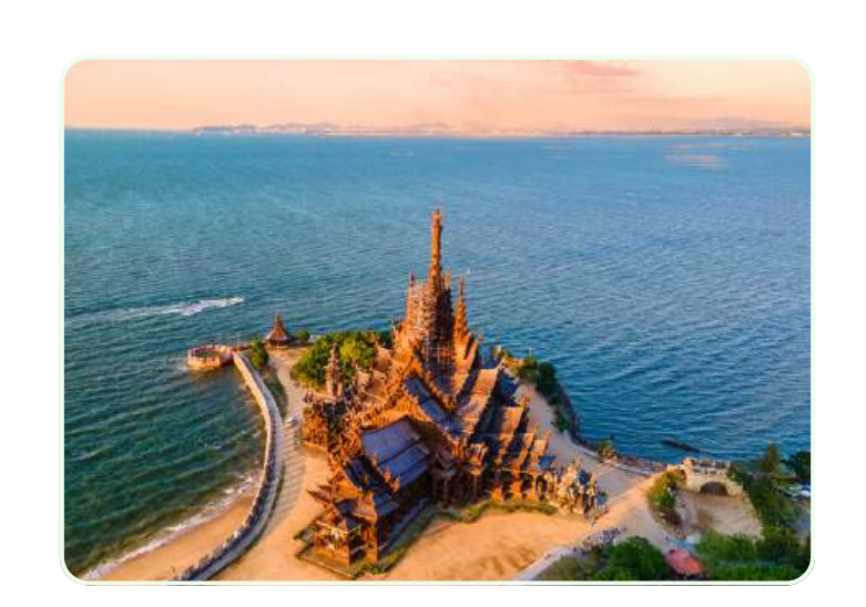
Sanctuary of Truth