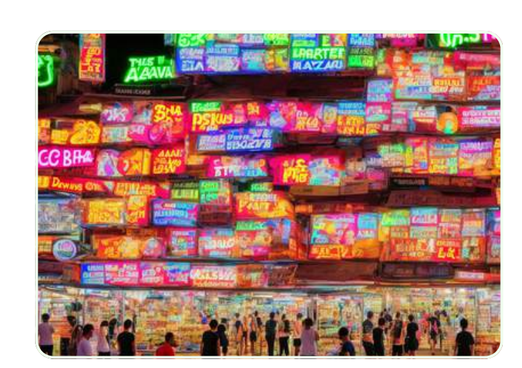
Pattaya Night Bazaar