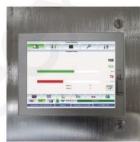
PRO Series ICON

Recently redesigned and updated, our new T550 user interface can operate up to three primary inspection sensors simultaneously and will incorporate up to four optional inputs as well. The interface has a color touch screen icon driven display with preset programs for quick product changeover. Display on-screen histograms for product monitoring or system diagnostics. Uses a USB drive for easy upgrades and additional storage of product presets.