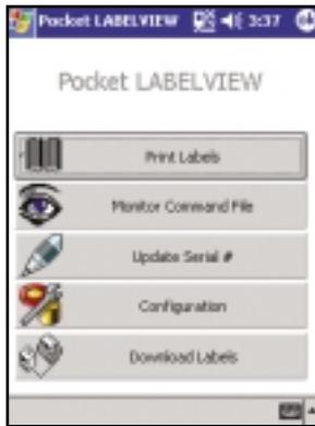
Pocket LABELVIEW Main Menu

Pocket LABELVIEW is a powerful, flexible, and easy-to-use Pocket PC-based solution for printing bar code labels. It allows you to take labels created in LABELVIEW label design and printing software, download them to your Pocket PC, and print them using a direct or wireless connection.