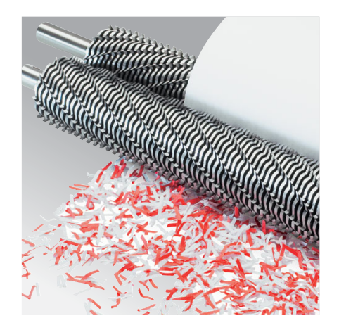
SOLID STEEL CUTTING SHAFTS

Robust and durable: high-quality paper clip proof cutting shafts with lifetime guarantee under conditions of fair wear and tear.