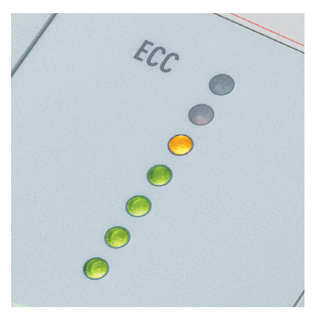
ECC - ELECTRONIC CAPACITY CONTROL This electronic feature indicates the used sheet capacity during shredding process to avoid paper jams.

Ease of operation: intelligent multifunction switch element with integrated optical signals indicating the operational status. Additional "emergency switch" function.