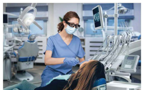
Real-time, hands-free information