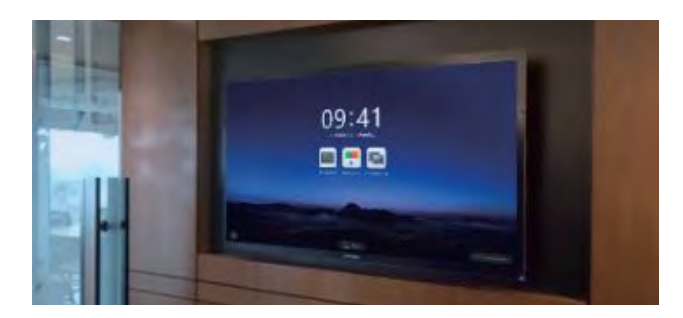
Oil & Energy | Indonesia | PT Indika Indonesia Resource (INDIKA Group)

International construction business, China Jingye believes in the value of having the right tools for innovation. To accelerate and enhance collaboration among a global remote workforce, the company connected with MAXHUB. Following a recommendation from their Singapore Branch, China Jingye discovered the power of the all-in-one MAXHUB device for wireless sharing, seamless teleconferencing and on-screen annotation.