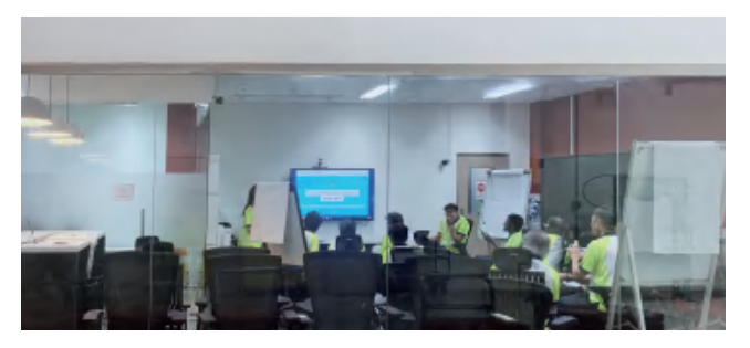
Manufacturing | Singapore | APB