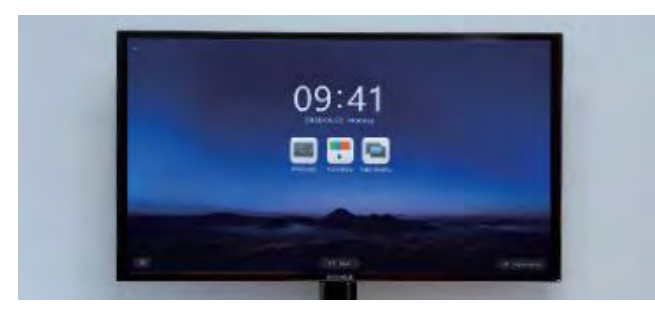
Construction | Indonesia | China Jingye Engineering Corporation Limited