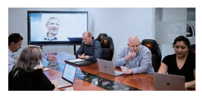
Service Provider | Australia | Queensland Computers Pty Ltd

Leading state-owned commercial bank, BOC is responsible for one of the biggest Macau banks in its local market. With MAXHUB's conferencing solution, BOC Macau can host videoconferencing sessions with screen sharing and up to 4 split mode options at any time, for real-time collaboration anywhere. Smooth audio and video supports an excellent experience for remote training, interviews, and teamwork.