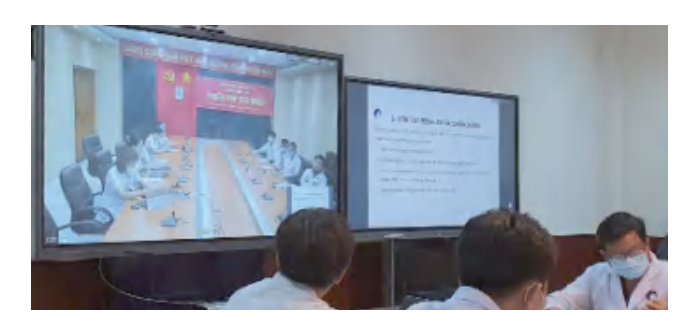
Healthcare | Vietnam | National Hospital of Odonto-Stomatology

LPTIC is a company on the cutting edge of telecom, IT, and post services. To stay ahead of the curve, LPTIC is investing in state-of-the-art innovation system. MAXHUB helps LPTIC bring teams together for more meaningful collaborative moments. The MAXHUB panel includes Android and Windows dual systems, and integrates with various software solutions. This ensures seamless connections between teams.