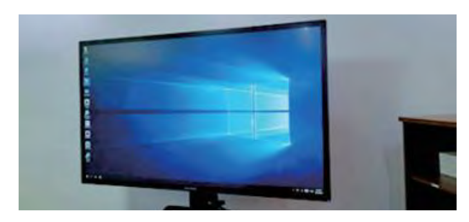
Professional Services | Lybia | LPTIC

Old-fashioned piecemeal solutions for collaboration are outdated. Legacy systems require complicated cable connections and extensive maintenance, reducing opportunities for agile innovation. PT Indika Indonesia Resource decided to overcome these issues by investing in the new MAXHUB all-in-one integrated solution. This wireless meeting room environment unifies meeting tools like never before, combining the features of a projector, whiteboard, display, and more.