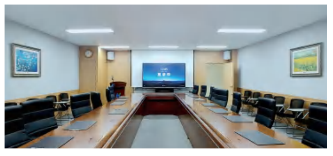
Government | Korea | KIRD

Professional service provider, BT Automation is committed to enhancing quality of life in the workplace, and home. To create the best possible environment for employees and customers, BT decided to work with MAXHUB. The MAXHUB interactive display transforms every meeting. Clients can interact with immersive software, connect with managers, and get feedback seamlessly. Unlocking final proposals just got easier.