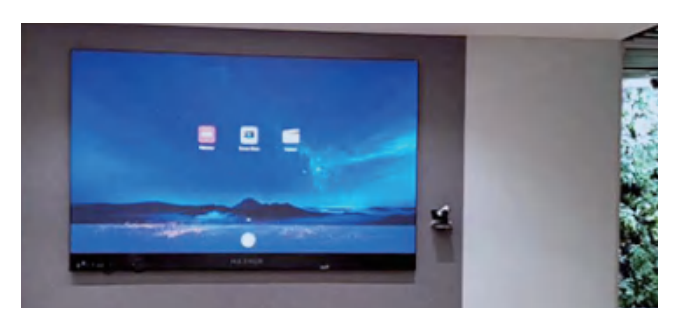
Service Provider | Singapore | Envision Digital International Pte. Ltd.

OLD Computers believes in inspiring innovation through education. Today, the company is leveraging MAXHUB IFP as a solution for simplifying everyday collaboration and communication. MAXHUB supports meaningful interactions through screen sharing, video, and touch-screen annotation. This next-generation technology helps QLD Computers to empower their clients on the path to digital transformation and ensure ongoing customer success.