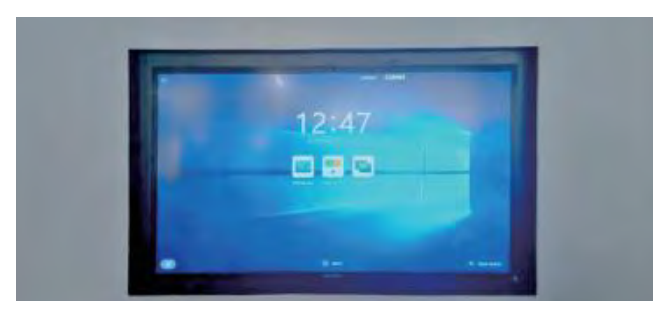
Retail | India | Lowe's Companies Inc

JAS, a leading international freight forwarder and logistics provider, use MAXHUB for collaboration. The company supports a global network of quality assurance offices. Close collaboration between these separate spaces can be difficult. MAXHUB gave JAS the flexibility to connect teams and improve customer experience.