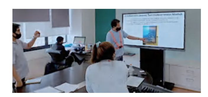
Manufacturing | Thailand | Sime Darby Oils Morakot

Getting the right technology in place is the first step to boost efficiency. Trans Thai-Malaysia was searching for a workplace solution that supports remote conferencing and wireless meeting opportunities. By deploying interactive flat panels in the workplace with MAXHUB, the company can enhance employee connections. Today's team members can enjoy faster, more efficient connections, while maintaining an innovative business environment.