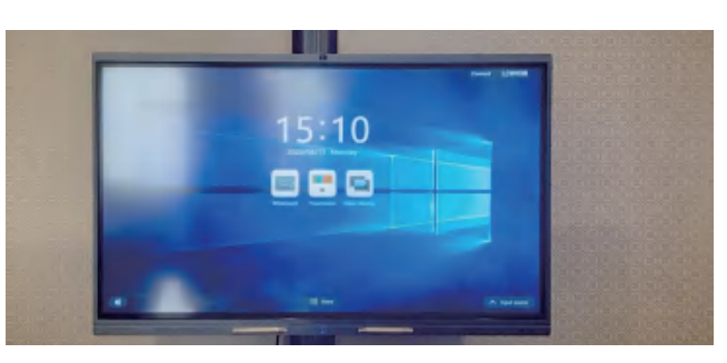
Service Provider | India | BT Automation

Lowe's, one of the largest home improvement retailers in the world, wanted a way to enhance client experiences. To help customers optimize their homes and businesses, Lowe's integrated MAXHUB displays into their establishments. MAXHUB with custom 3D enabled software helped Lowe's to create an informative space where customers can learn about the company history, and its latest innovations.