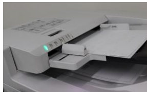
Asset Label Signage