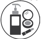
Health & Beauty