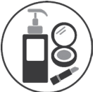
Health & Beauty