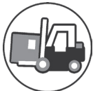
Inventory & Logistics