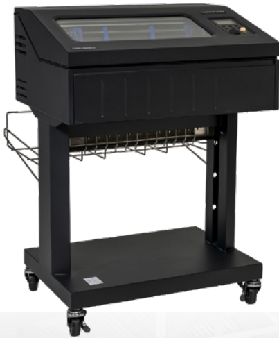
Open Pedestal for easy forms access with a small, maneuverable footprint.