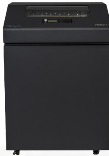
Quiet Cabinet for large, unattended and secure print jobs.