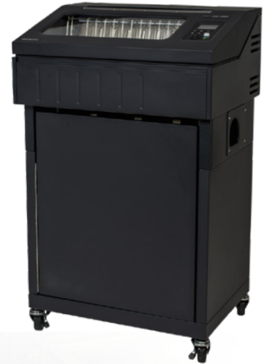
Zero Tear for on-demand printing without forms waste.

Only Line Matrix offers proven high reliability, uptime performance and environmental responsibility. All delivered by the power of OpenPrint from Printronix.