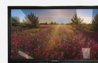
Without anti-glare film

Protecting the screen is an Anti-Glare film which use for reduce glare reflections and also minimize fingerprint on the glass. Anti-Glare technology will produce a more legible text and clearer image display.