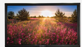
With anti-glare film