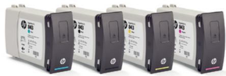
8 HP PageWide XL ink cartridges (2 x 400-ml per color with auto-switch)