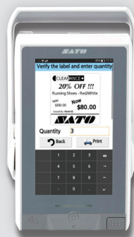
Check Preview & Enter Quantity