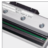
Easy Print Head Replacement