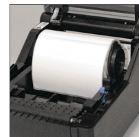
Drop-Load-Go Media Bin