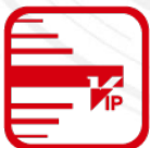
High Priority Ports