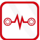
8-Core Power Supply