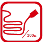
300 m Transmission