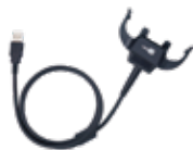
USB snap-on Cable