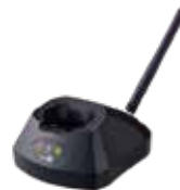
3G Cradle / GPRS Cradle (Quad Band)