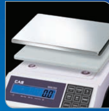
Double tray type (Plastic and stainless steel)