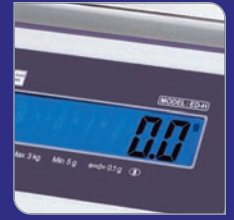
Blue backlight LCD