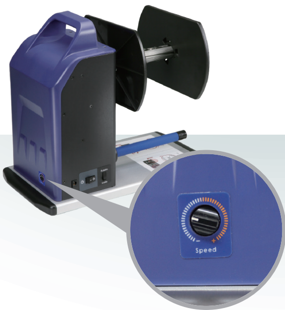
VR (Speed Adjustment)

Depending on the user's requirements, the rewriter can rewind "inside or outside" label rolls.