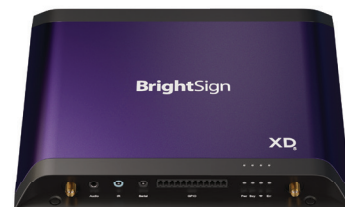
Expanded I/O Package