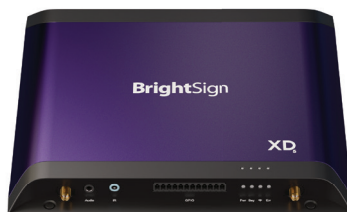
Standard I/O Package