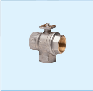
Diverter brass ball valve [Rb art. 3210 (L)] full bore female threaded, "L" port.

PLEASE SPECIFY THE FLOW PATH WHILE ORDERING.