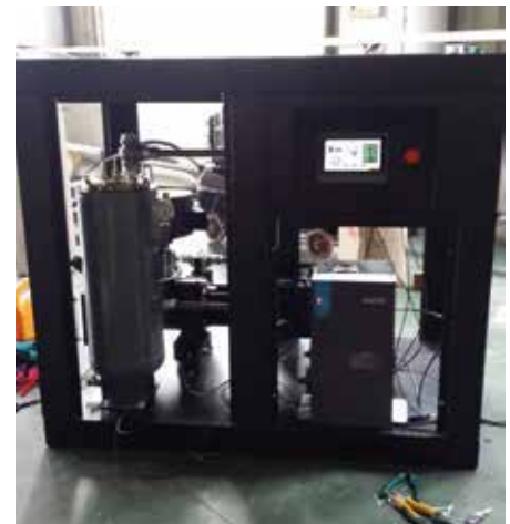
▲ YC3000 series 22kw application