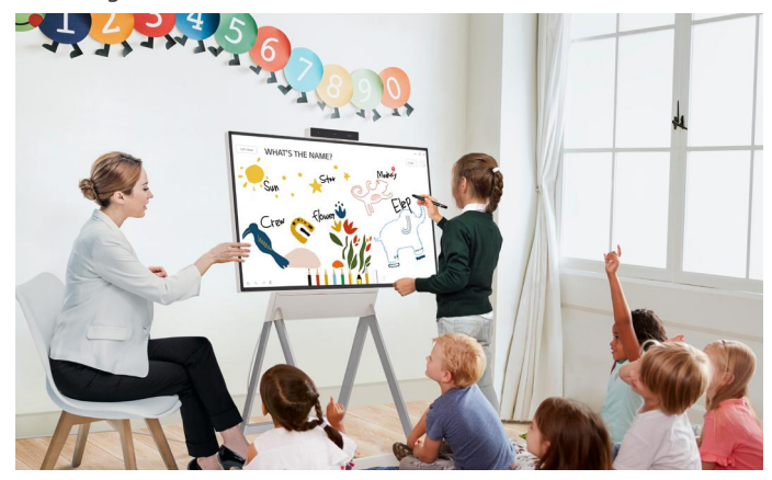
An interactive educational tool for the child, with which their drawings and writings from during class can be saved as image files.