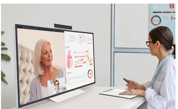
Perform simple consultations or medical examinations remotely without meeting with the patient.