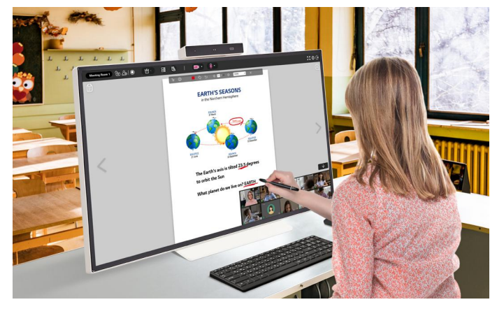
Write on teaching material and have remote lessons without any additional equipment.