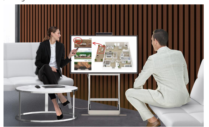
Have meetings and demonstrations with clients and contract in one place.