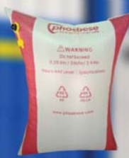
PP DUNNAGE BAG