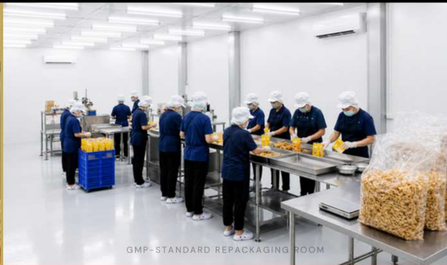
GMP-STANDARD REPACKAGING ROOM

“ Every product that leaves our facility has passed through rigorous quality checks — from raw ingredient sourcing to final packaging. We don't just manufacture snacks. We build trust.