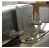
Lifting cover lockable in 3 positions