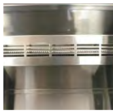
Internal evaporator fan with protective guard

Popular Pizza / Sandwich prep suitable for standard GN pan.