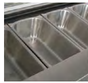
Air vents blowing cold air over G/N pan