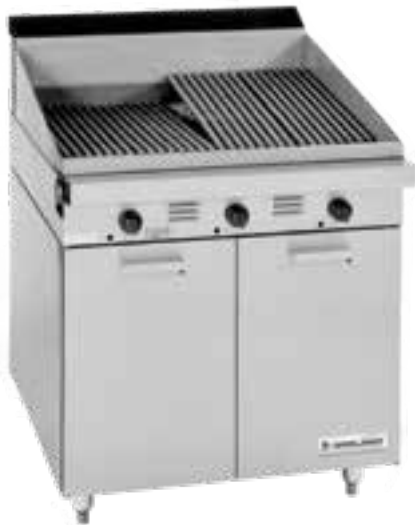
Model M34B (valve control panel not as depicted) Range-Match Char-Broilers